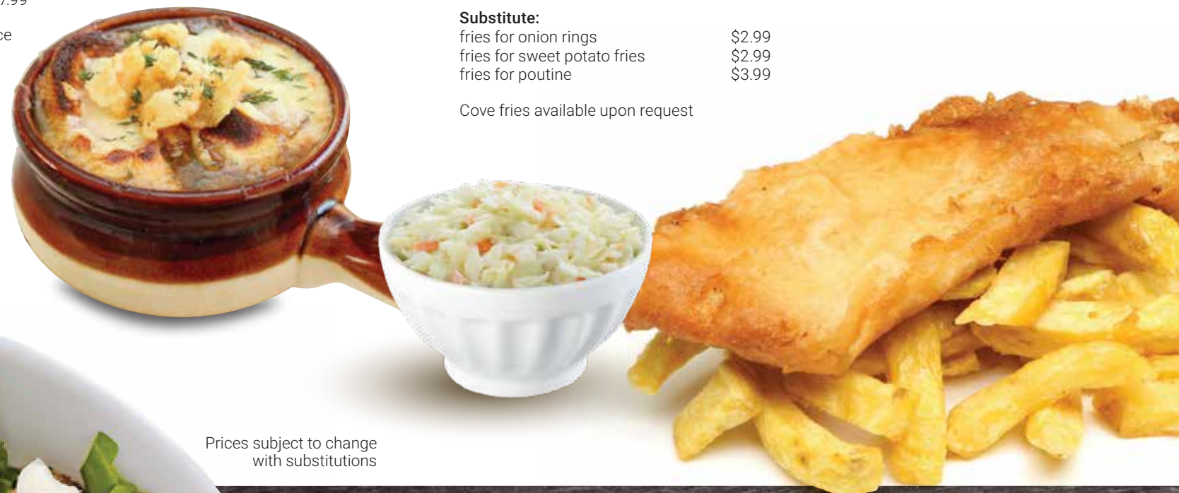
Prices subject to change with substitutions

ALLERGIES/CELIAC: Customers concerned with food allergies/celiac need to be aware of this risk. We do not assume any liability for adverse reactions to foods consumed or items anyone may come in contact with while eating at our establishment. Please inform your server of allergies/celiac.