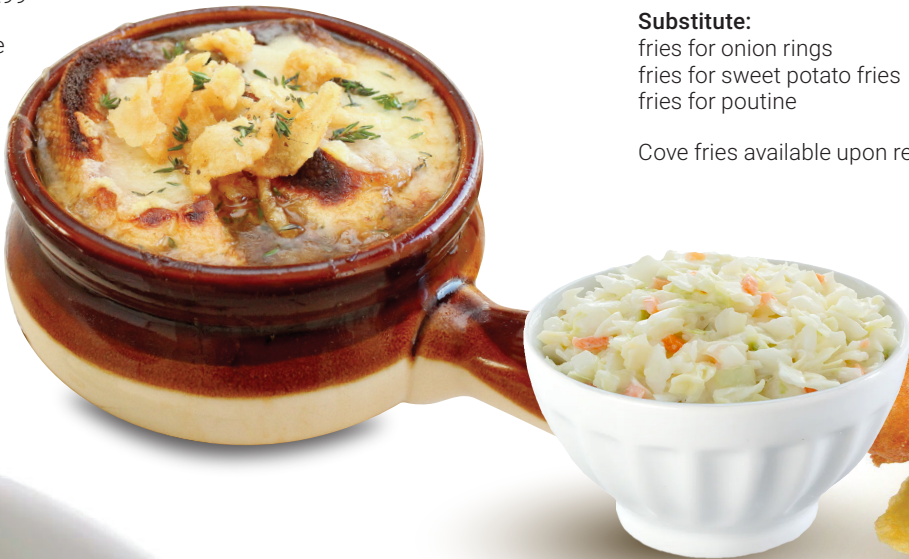
Prices subject to change with substitutions

Garlic Bread $7.99 Garlic Bread with Cheese $8.99 Tempura Mushrooms $9.99 with ranch dipping sauce Mozzarella Sticks $9.99 with chipotle mayo dipping sauce Jalepeño Poppers $9.99 with ranch dipping sauce Coconut Shrimp $11.99 6 crispy coconut shrimp, served with a pineapple chutney sauce Spinach Artichoke Dip $15.99 A baked blend of spinach and marinated artichoke hearts, roasted garlic, red onion and a blend of cheeses, topped with cheddar cheese and served with pita bread